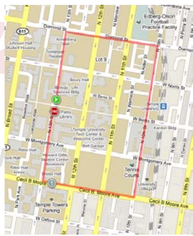
PROPOSED'11 TEMPLE COURSE